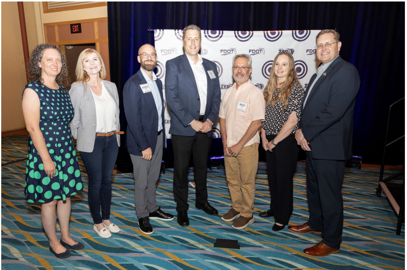
All 5 MPO/TPO's from the Central Florida District 5 area represented on at the Safety Summit

Transportation partners from across Central Florida recently convened for FDOT's inaugural Safety Summit, which was held at the Port of Call ballroom at SeaWorld Orlando. This event highlighted FDOT's Strategic Safety Plan, which provides a framework for collaboration on their Target Zero campaign to reduce serious injuries and fatalities from traffic crashes to zero. The summit drew a diverse group of attendees, including elected officials, law enforcement officers, engineers, and representatives from transportation planning organizations throughout District 5, covering Brevard, Flagler, Lake, Marion, Orange, Osceola, Seminole, Sumter, and Volusia Counties.