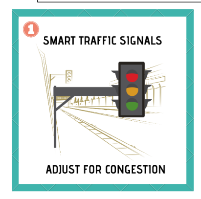
Top 3 Desired Changes to Transportation