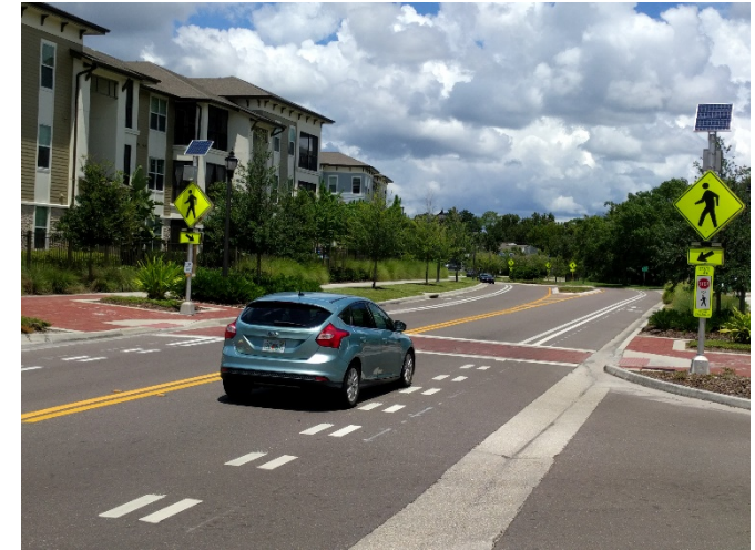
North Oxford Road