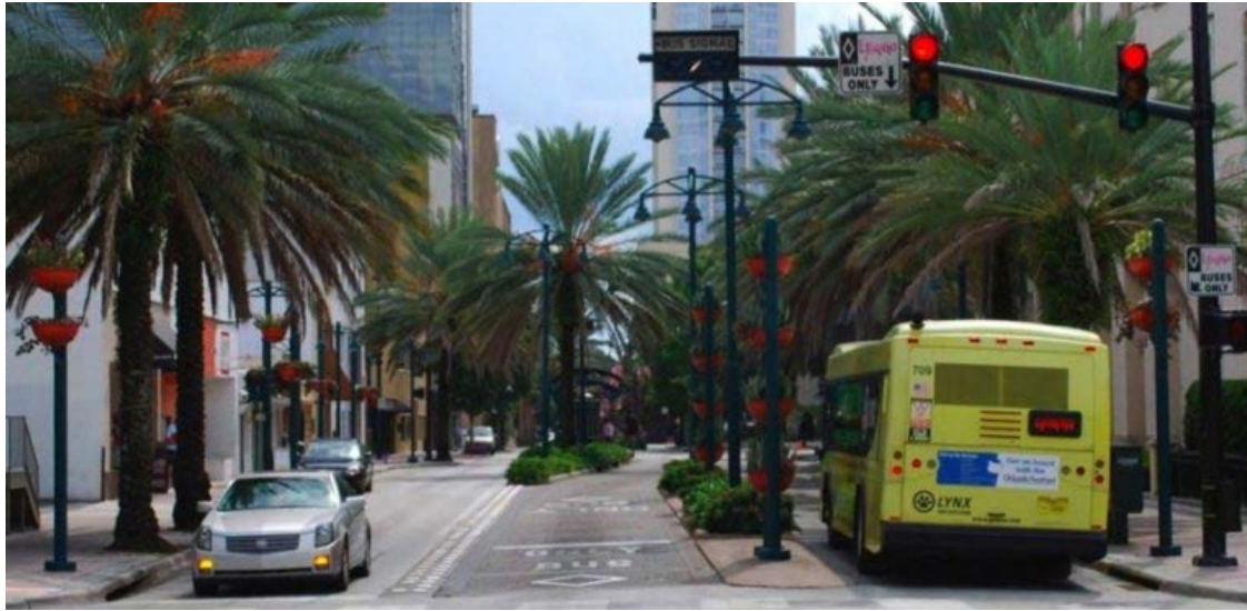
Downtown Orlando