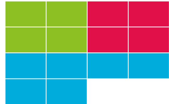
3 sections with 14 tasks